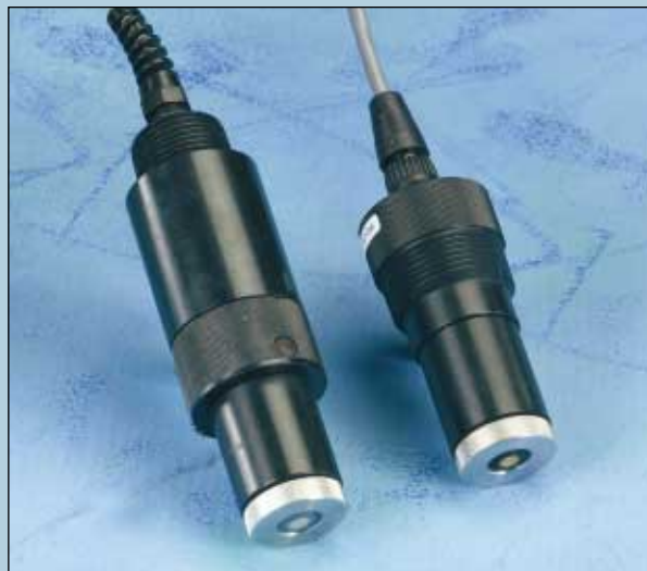
Submersion and Flowcell Sensors

For applications where the second analog output is desired or where alarm relay functions are needed, an AC powered system is available. Operation from AC power allows the user to utilize analog outputs for both ozone and pH, or for independent PID and ozone outputs, or simply for ozone and temperature outputs.