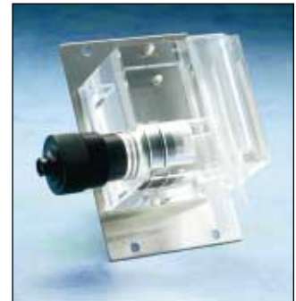
Constant Head Flowcell