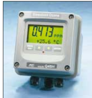
Dissolved Ozone Monitor

Available in loop-powered, AC operated, or battery operated portable versions, the Q45H/64 is well suited for almost any \text{DO}_3 measurement requirement. Even a portable data-logging version is available for temporary installation or process studies. And for even more flexibility, the instrument is available with an optional pH sensor input that allows a single unit to provide both dissolved ozone and pH analog outputs.