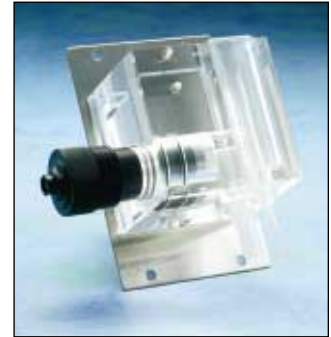
Constant Head Flowcell