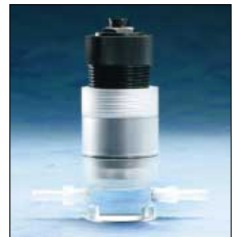
Low Volume Flowcell