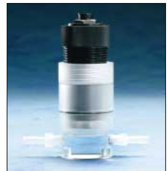
Low Volume Flowcell