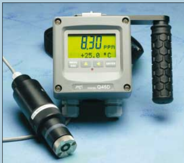
Portable Ozone Monitor

For even greater versatility, a portable unit powered by a standard 9 V battery is also available. The dual 0-2.5 VDC outputs are assignable to ozone concentration and temperature. This instrument can be supplied with an internal data-logger, making it ideal for short term monitoring at remote sites. The unit will run for 10 days on a single battery, and the data-logger will store up to 32,000 data points, easily enough for 10 days of data at 1-minute intervals.